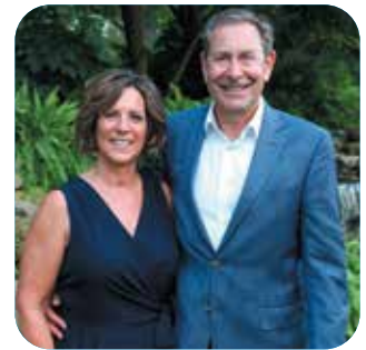
The Mastroianni Family Alliance Ventures