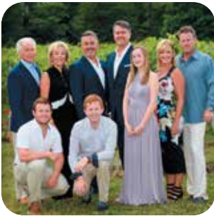
The Swaldo/Blackerby Family W+ Gervasi Vineyard