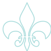
Two Ordre de Liberté members wish to remain anonymous