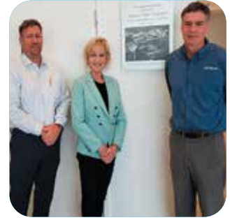
The Kempthorn Family + Kempthorn Motors, Inc.