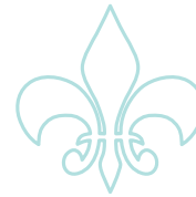
One Ordre de Généreux member wishes to remain anonymous