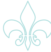
The W. Henry Hoover Fund +