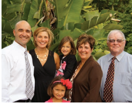
The Biery Family Biery Cheese Company