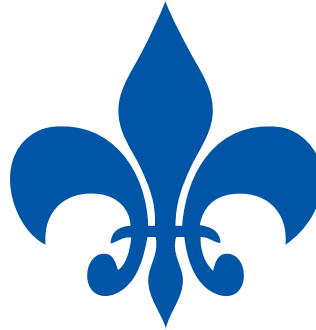
The W. Henry Hoover Fund