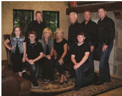
The Swaldo/Blackerby Family Gervasi Vineyard *